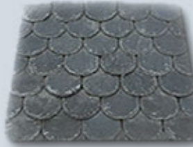
Short Scallop Shape Add $0.08 Per sq.ft