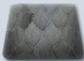
Rectangle Add $0.10 Per sq.ft