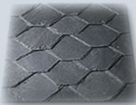
Corner Beveled Add $0.05 Per sq.ft