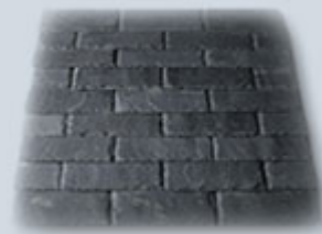
Rectangle Add $0.00 Per sq.ft