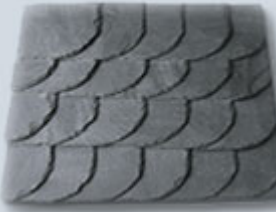
Fan Shape Add $0.09 Per sq.ft