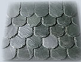
Long Scallop Shape Add $0.07 Per sq.ft