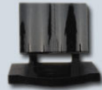
AMN-708 30x24x6 Base: 36x20x6