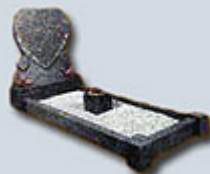
AMN-702 30x30x60 Overall