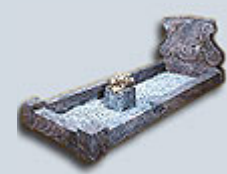
AMN-704 30x30x60 Overall