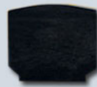
AMN-712 Headstone 30x30x6