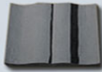
AMN-710 Headstone 30x30x6