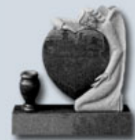
AMN-801 36x36x12 Overall