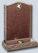
AMN-721 30x42x6 Base: 36x12x6