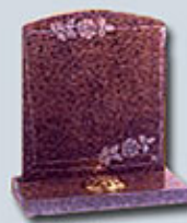
AMN-715 30x42x6 Base: 36x12x6