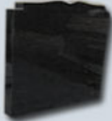
AMN-709 Headstone 30x30x6