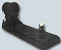
AMN-701 30x30x60 Overall