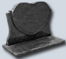
AMN-706 30x24x6 Base: 24x12x6