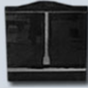
AMN-711 Headstone 30x30x6