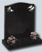
AMN-722 30x42x6 Base: 36x12x6