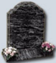
AMN-713 30x42x6 Base: 36x12x6