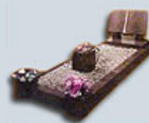
AMN-703 30x30x60 Overall