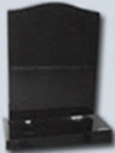
AMN-720 30x42x6 Base: 36x12x6