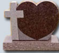
AMN-707 30x24x6 Base: 24x12x6