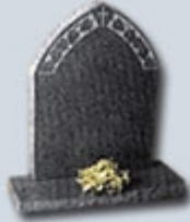
AMN-714 30x42x6 Base: 36x12x6