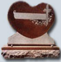
AMN-705 30x24x6 Base: 24x12x6