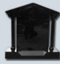
AMN-723 36x36x6 Base: 36x18x8